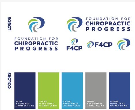
F4CP Brand Sheet