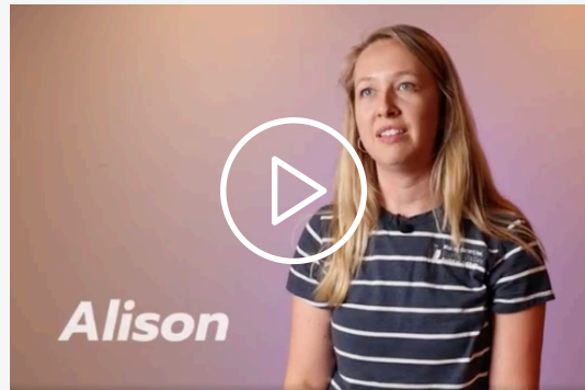
Book Review Video