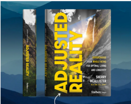
Social Media Infographics